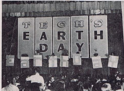
There were 13 brave students who, dressed in their country "duds", volunteered to hold letters for the caption "Tech Earth Day."

It really isn't hard to believe after all, that even though all he does is sing, the album is immediately thought of as his album. Listening is proof enough.